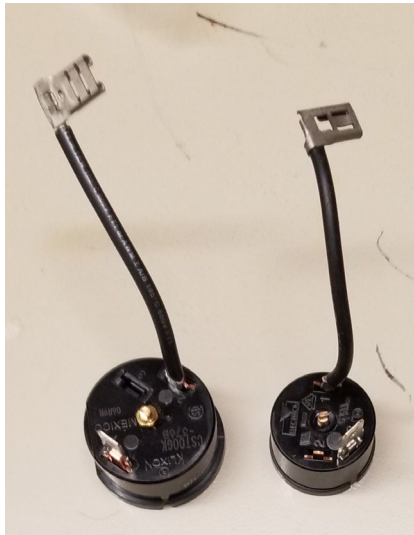
Figure 3: Current 9181005-45 on the left, previous design on the right

Ice-O-Matic's supplier of the 918005-45 compressor overload (used in older versions of the 9181137-01 compressor) added an alternate manufacturer for the overload in 2019. This alternate manufacturer is now the only provider of the part, and it has a larger outer diameter that makes for a tighter fit into the mounting grommet on the compressor. While this may cause more difficulty during installation, it does fit. The current version of the 9181005-45 is the compressor manufacturer's preferred replacement.