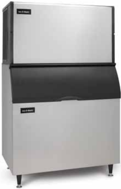
ICE1806 ON B100